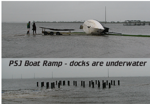
PSJ Boat Ramp - docks are underwater

Some 45 tornadoes were reported throughout the day, mostly in the central and eastern parts of the state, the National Weather Service said. They confirmed two tornadoes had hit ground in Brevard County. At least eleven deaths have been reported in the state so far, and there's still a risk of more damage from flooding as the St. John's River continues to rise.